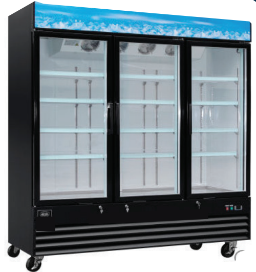
SG1.9L3-HC Swing Door