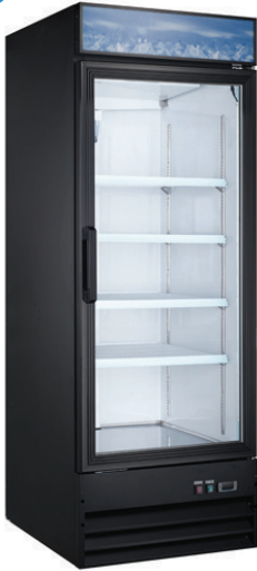
G648BMF-HC Swing Door