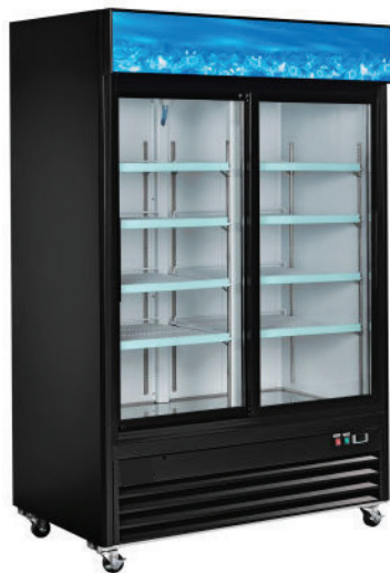
G1.2YBM2F-HC Sliding Door